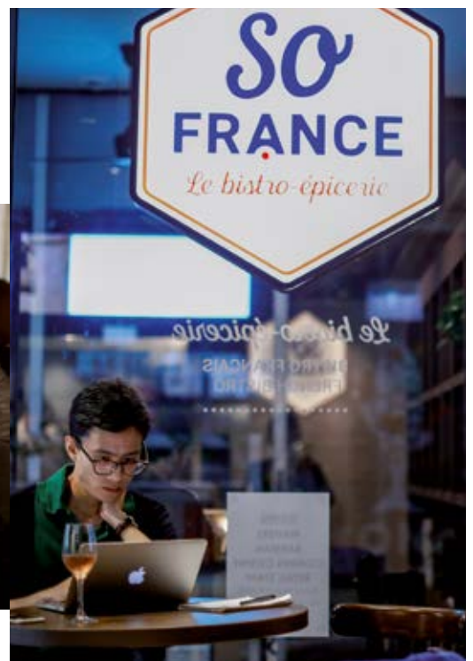
So France, the bistro-gourmet grocery store, a venue designed for epicureans in Singapore.