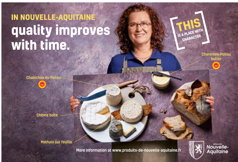
2019 AANA Marketing Campaign.

Those marketing campaigns state our values loud and clear: pride, authenticity, solidarity, accountability and ethics.