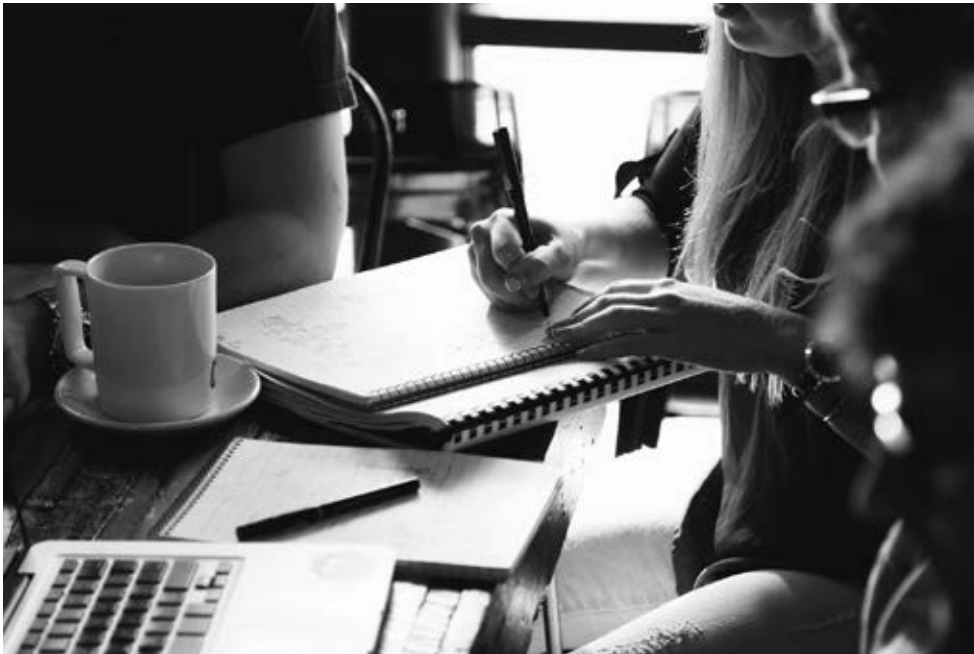
Discussions and brainstorming on the challenges of tomorrow.