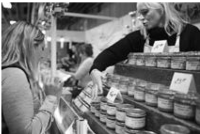
Producers present their products to the attendees at the International Agricultural Show in Paris.