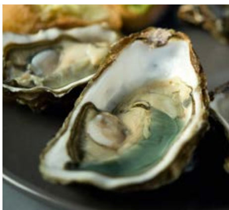
Marennes Oléron PGI oysters.

AANA is tackling all these fronts. In keeping with our ethical principles and accountability, we make our expertise available to the various industries to strengthen their quality approach, share the wealth of our gastronomic heritage, and boost new projects.