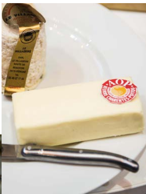
Charentes-Poitou PDO butter.