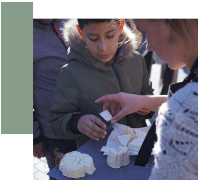
Producers meet-and-greet consumers during the Tuk-Tuk campaign.