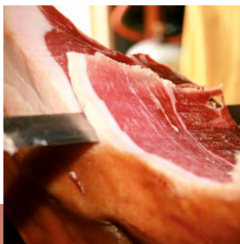
Bayonne Ham (PGI).

AANA called on the know-how of the Agri-food CRITT (Regional Centre of Innovation and Technology Transfer) in La Rochelle and the ITERG (Oils & Fats industrial technology centre) in Pessac, with financial support from ADEME (French Environment & Energy Management Agency) and the Nouvelle-Aquitaine region.