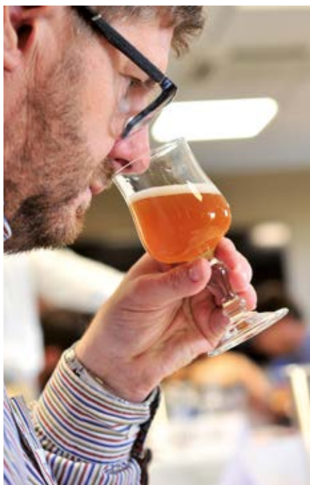
Beer tasting during the Nouvelle-Aquitaine "Concours Saveurs" - Agen.

The different medals - Gold, Silver, Bronze or the Jury's Distinction - honour gastronomic innovations, recipes and products as well as represent a selection criteria for consumers. They increase sales and visibility of the award-winning products.