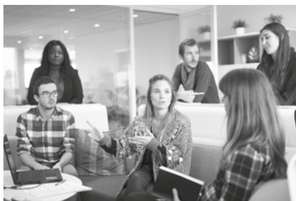
Sharing on collaborative projects.