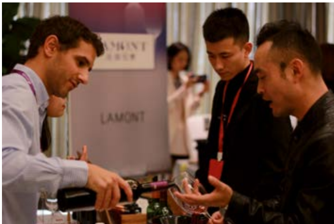
Tasting at the Bordeaux & Nouvelle-Aquitaine Wine Festival in Wuhan, China.

We take part in over 30 events internationally and nationally. We also do “country spotlights” and product sourcing operations.