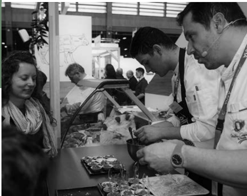
Raising public awareness during culinary demonstrations, International Agricultural Show in Paris.