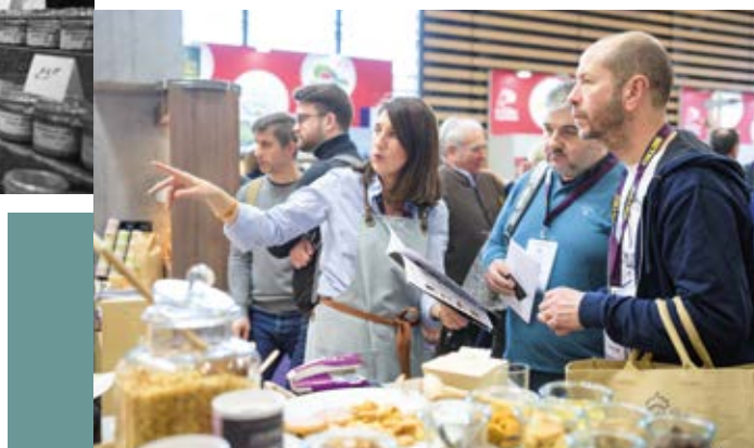
Meetings with professionals at the Sirha tradeshow in Lyon.